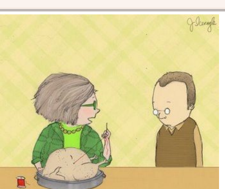
Basting the turkey. What does it look like I'm doing?

The Porterville Quilters Club meets on the third Thursday of each month at the First Congregational Church, located at 165 East Mill Avenue in Porterville. Meetings begin at 10:00 a.m. Guests are always welcomed. There is no charge to attending guests.